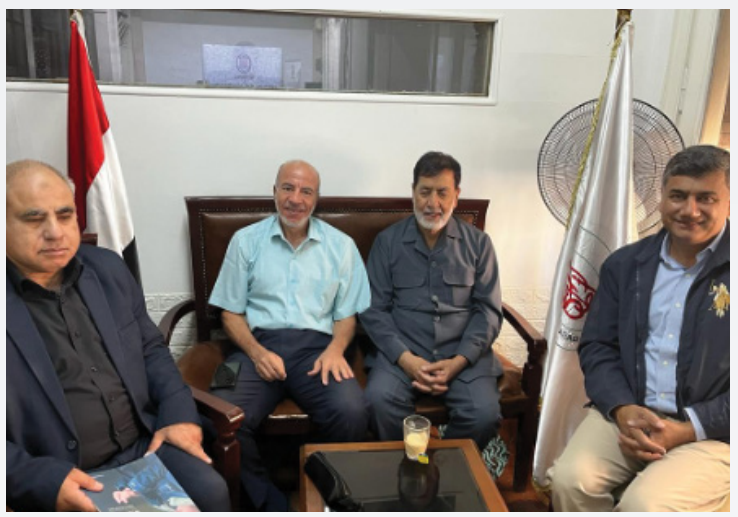
Meeting with President of Arab Medical Union Cairo, Egypt.