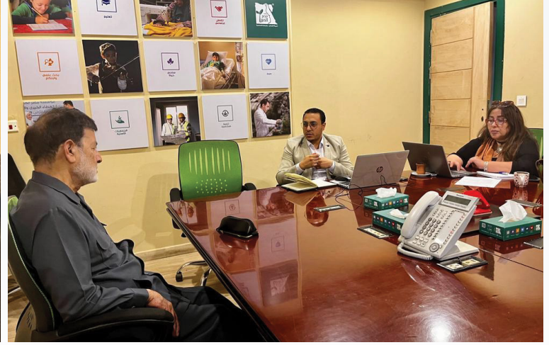
Visiting Alkhair Foundation office in Egypt.