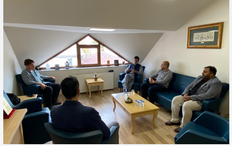
Meeting with Vice Presidents of IHH Turkiye.