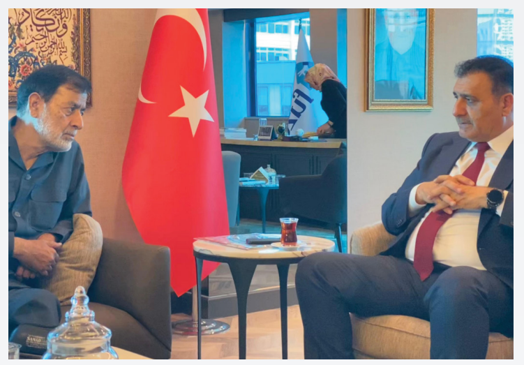
Meeting with Secretary General of THE UNION OF NGOS OF ISLAMIC WORLD (UNIW).