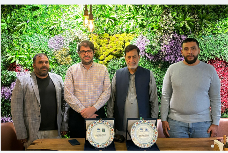
Meeting with CEO ONSUR.