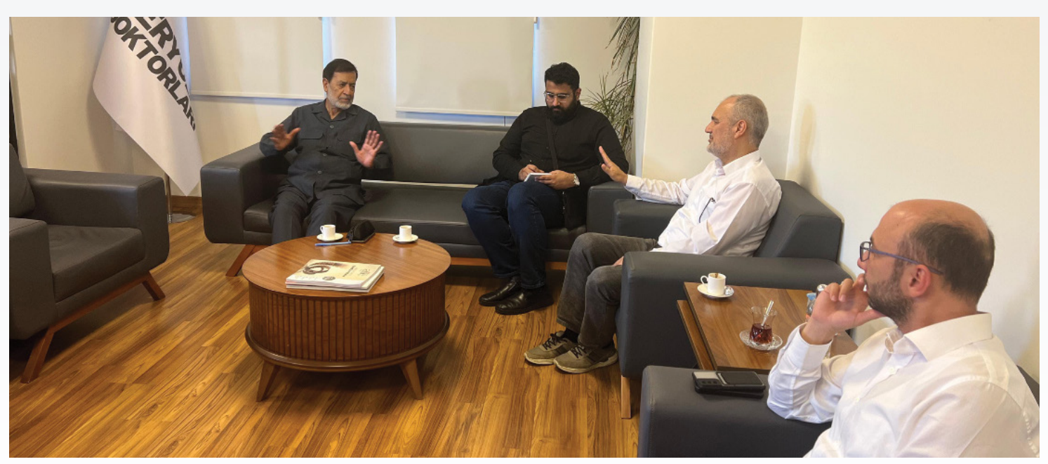
Meeting with President of Doctors Worldwid-Turkiye