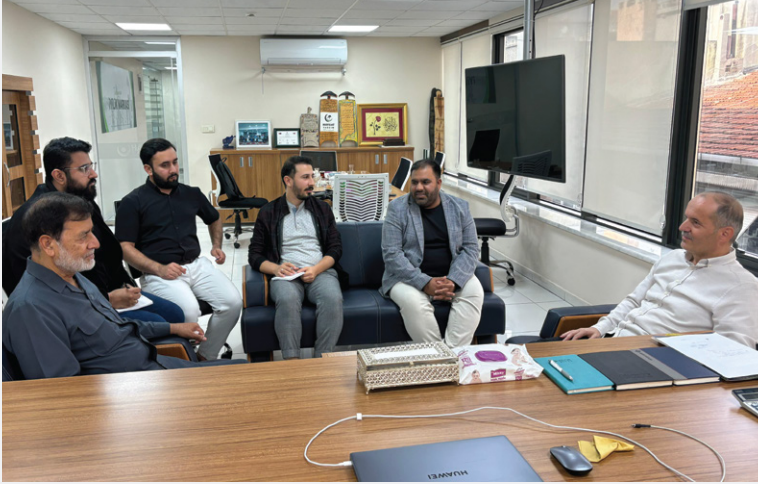
Meeting with President of Hayrat Yardim.