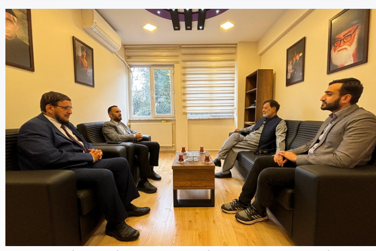
Meeting with Delegation of CRB during a visit to Aghosh Turkiye.