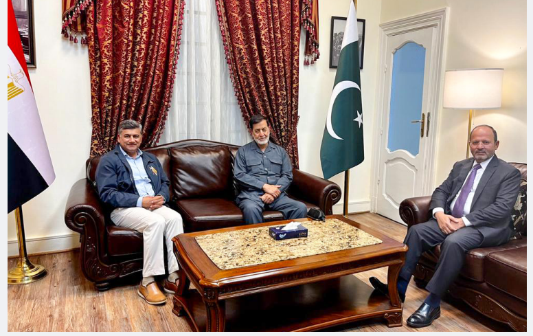
Meeting with Ambassador of Pakistan in Cairo, Egypt.