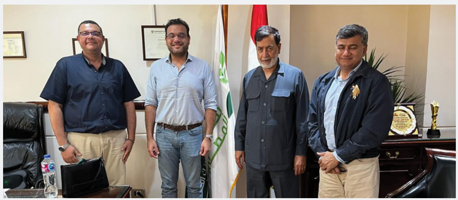
Meeting with CEO of Egyptian Food Bank Cairo, Egypt.